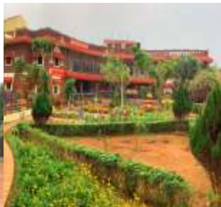
Model center for Children with Special Needs