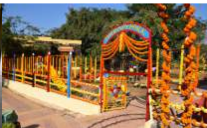
Therapy Park & Herbal Garden