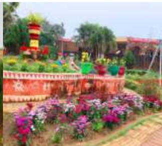
School for Autism