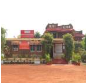
Institute of Health Sciences