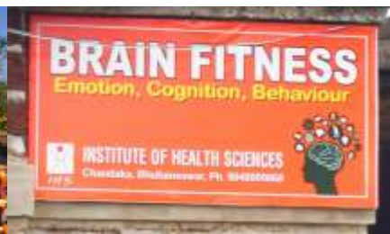
Brain fitness for mental Health