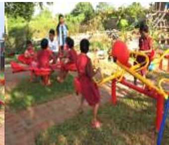
Aditi Integrated School